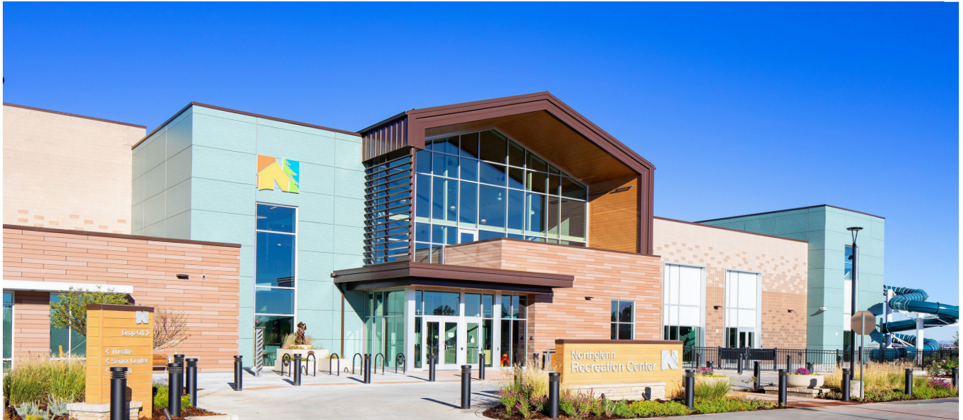
DETAIL: NORTHGLENN RECREATION CENTER, SENIOR CENTER AND THEATRE, NORTHGLENN COLORADO, / BARKER RINKER SEACAT ARCHITECTURE