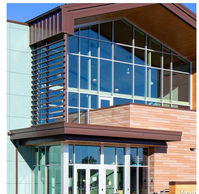
PANEL DETAIL: FIBER CEMENT

info@ecocladding.com www.ecocladding.com