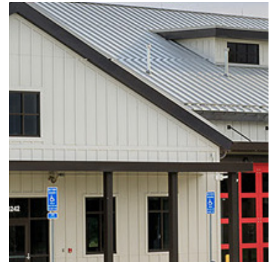
PANEL DETAIL: SWISSPEARL FIBER CEMENT

An ECO Cladding Vci.10 subframing system was utilized in this single-story fire station that staffs an engine, ambulance, tanker, and brush unit as well as the county's swift water rescue team, which consists of rescue boats and a support vehicle. The design blended the station with the local architectural native to the surrounding farming community and as a result achieved a balance of form and function to serve the community for years to come. The facility earned LEED Silver certification.