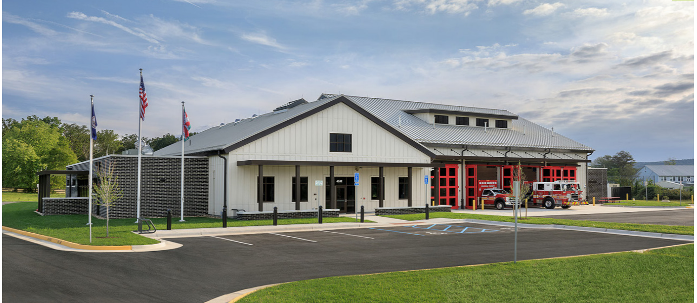
DETAIL: LUCKETTS FIRE & RESCUE STATION - #10 / MOSELEY ARCHITECTS