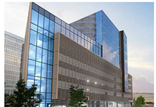
DETAIL: ACM PANEL CLADDING

855.237.3370 info@ecocladding.com www.ecocladding.com