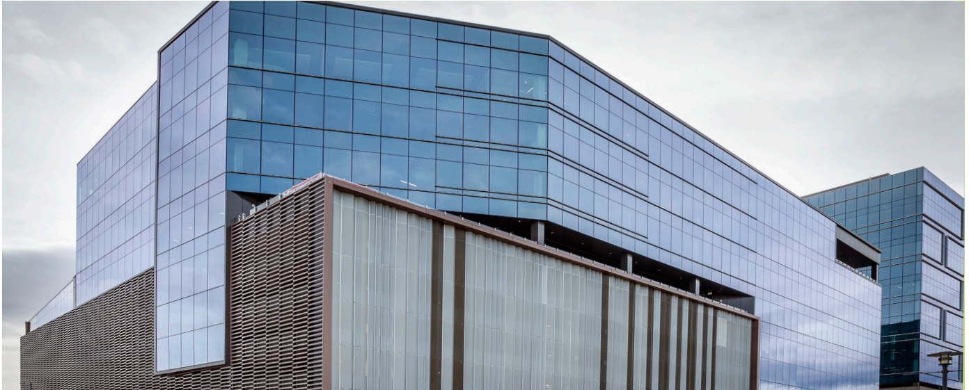
ELEVATION: VECTRA BANK CORPORATE CENTER - DENVER, CO / OPEN STUDIO ARCHITECTURE