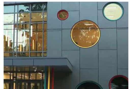
DETAIL: SWISSPEARL REFLEX DARK SILVER PANEL

SLAM Collaborative - CT has designed another eye-catching rainscreen design with the new James L. McGuire Elementary School. Continuing their history of using Swisspearl fiber cement panels, SLAM was the first project in the USA to incorporate the new Swisspearl Reflex Dark Silver metallic color. One of the strengths of the Reflex Dark Silver metallic color from Swisspearl is the ability to be fabricated into unique shapes, and what better location for a fun, creative design than an elementary school. The design team utilized an Alpha Hci.10 face-fastened subframing system with two different bracket lengths to accommodate the innovative design and variations in cavity depth. With this project, all involved parties rose to the challenge of this innovative design, with SLAM leading the charge with developing these eye-catching details.