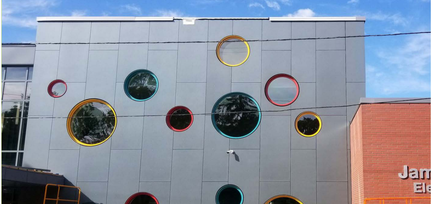
ELEVATION: JAMES L. MCGUIRE ELEMENTARY SCHOOL / SLAM COLLABORATIVE