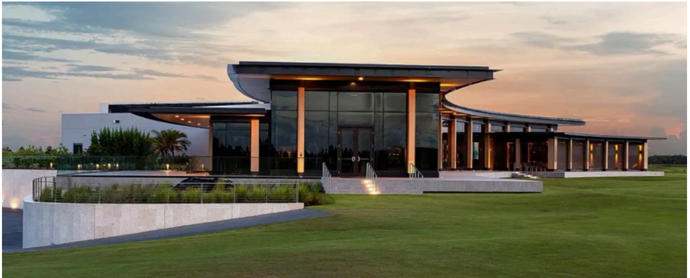
ELEVATION: GROVE XXIII CLUBHOUSE - HOBE SOUND, FL / NICHOLS ARCHITECTS