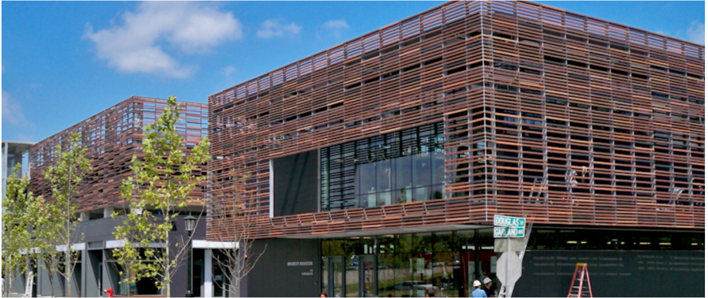
ELEVATION: UNIVERSITY OF ARKANSAS BOOKSTORE & PARKING GARAGE - FAYETTEVILLE, AR