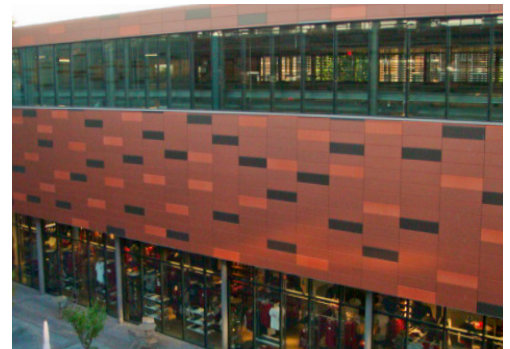
DETAIL: TERRACOTTA RAINSCREEN PANELS WITH VCI.45 SYSTEM

The University of Arkansas Bookstore & Parking Garage is an outstanding award-winning project and has inspired numerous other university-based projects across the country. Designed by Des Moines-based HLKB Architecture, installation incorporated a Terra5 Terracotta Rainscreen, a Fiber Cement Rainscreen, and a unique Terra5 Baguette Sunscreen. Vci.45 and Vci.11 subframing systems formed the basis for all of the rainscreen attachments, including a custom-tailored sunscreen assembly solution, engineered by ECO Cladding.