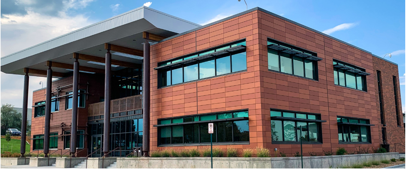
ELEVATION: GREENWOOD VILLAGE PUBLIC WORKS / D2C ARCHITECTS