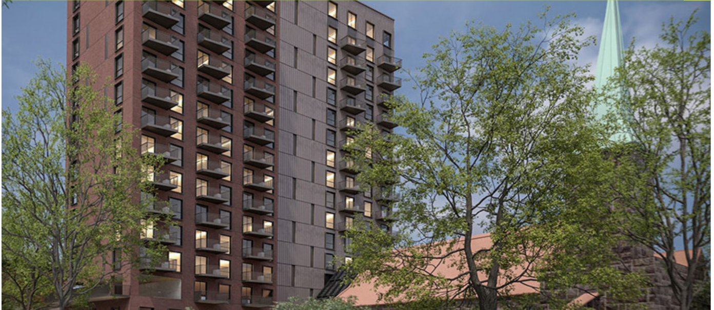
ELEVATION: 230 CLASSON AVENUE - BROOKLYN, NY / DXA STUDIO