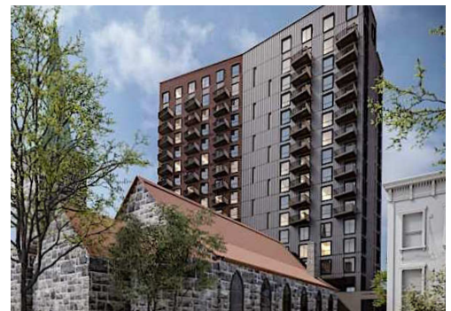
DETAIL: EXTERIOR METAL PANEL FACADE

Designed by DXA Studio, the forthcoming 230 Classon multifamily building will feature 138 one- and two-bedroom, mixed-income residential units. This 17-story development under construction in the Clinton Hill section of Brooklyn will be situated on a parcel of land controlled by St. Mary's Episcopal Church, rising above and bordering the historic mid-19th century church structure. The existing three-story rectory will be demolished. Expected to be completed in Spring 2023, this project showcases the versatility of ECO Cladding components going under 30,000 sq ft of multiple panel types, including very en vogue corrugated metal panels. A Vci.10 subframing system will be utilized.